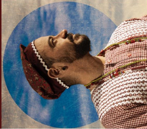
Exhibit Dates & Hours

Danville Congregational Church UCC 989 San Ramon Valley Blvd Danville, CA