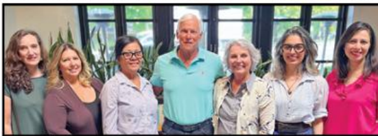
Danville Dementia Day Care team.

Valley Oak Respite Center, located at 989 San Ramon Valley Blvd. in Danville has provided adult day care for local memory-impaired adults for more than 30 years. Caring for loved ones with dementia is a 24/7 responsibility. Respite care allows caregivers freedom for four hours a day that they would not otherwise enjoy. The program helps adults with dementia to be more