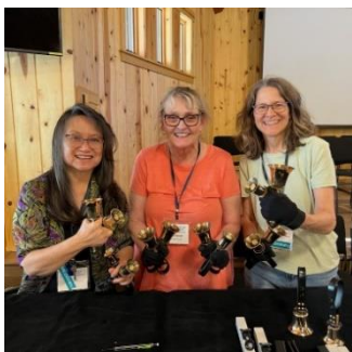
Our "official" DCC picture