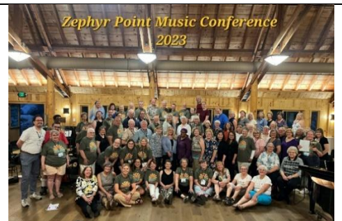
About 35 handbell ringers out of 100 (COVID years lowered our numbers tremendously!)