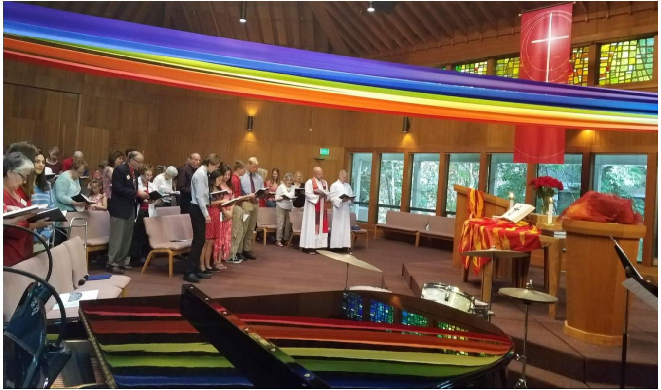
Pentecost Sunday, 2019.

For 21 years, Danville Congregational Church has been a safe, welcoming sanctuary for LGBTQ+ people. Though we are not gathering in person during Pride Month this year, our pride for all God's rainbowhued children will be on display and in action! Watch your inbox Monday for a special Pride Week email full of ways to show our Pride!