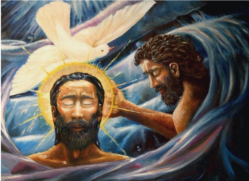
Baptism of Christ by David Zalenka